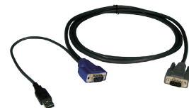
1-to-2 cable for USB PC connection